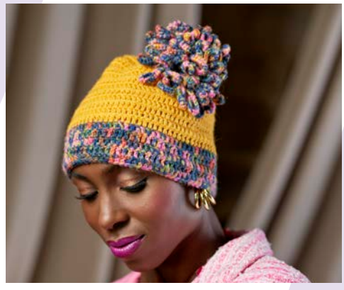
ColourLab DK Version Two