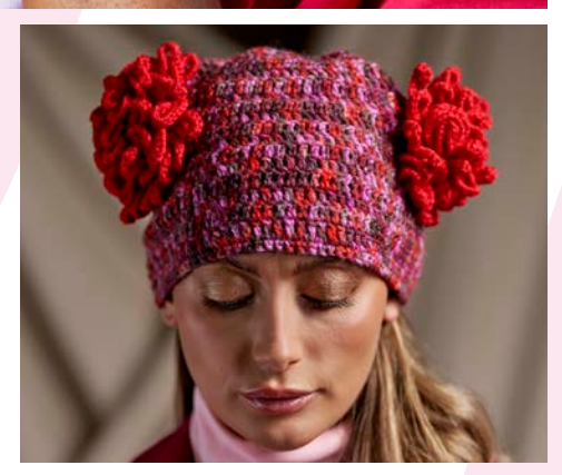
Signature 4ply Version Four