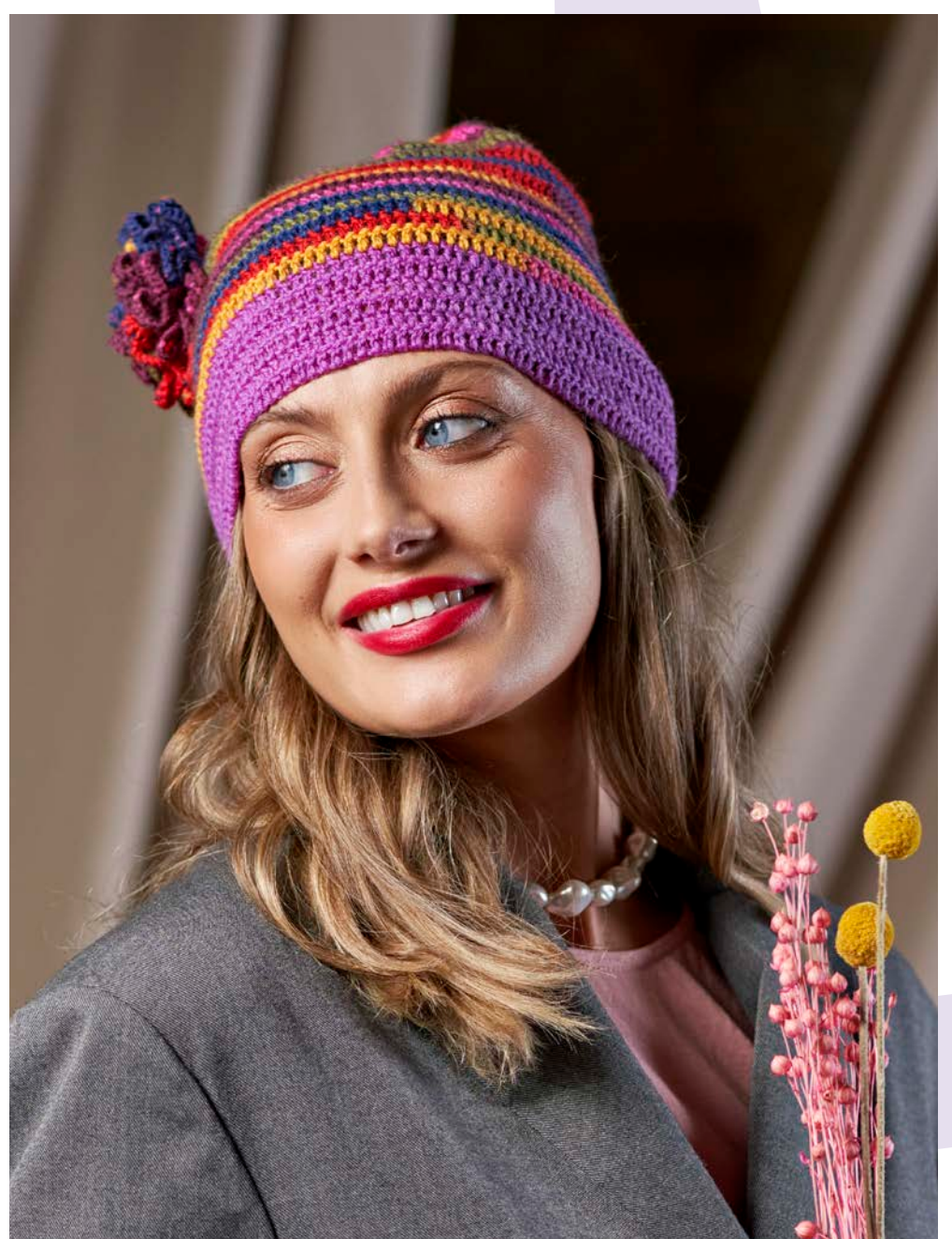
ColourLab DK Version One