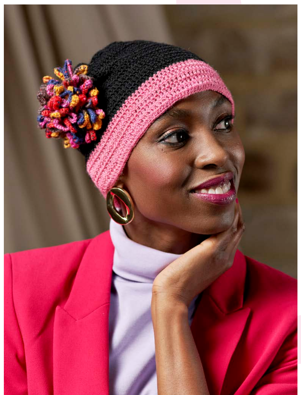
Signature 4ply Version Three