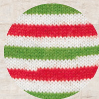
Candy Cane (989)