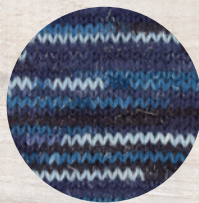
Silent Night (906)