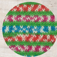
Fairy Lights (905)